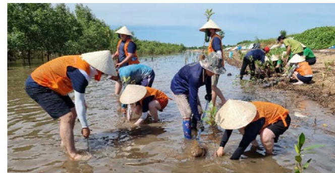
SK Innovation carried out mangrove planting activities.

Since 2017, SK Innovation has hosted the Great Music Festival (GMF), which boasts the largest scale among music festivals held for people with developmental disabilities in Korea. This annual concert supports people with developmental disabilities to seize opportunities to grow through music. We have cultivated 161 performing groups and over 17,000 performers through this event until 2022. The GMF Charity Night Gala is a concert that the winning teams of GMF present to diplomatic missions to Korea. In 2022, the concert took place in Busan, one of the host candidates of World EXPO, for diplomats and their families from 38 countries. In 2023, we are exploring ways to expand our musical support programs for people with developmental disabilities outside the country, such as in the United States and China, aligned with GMF.